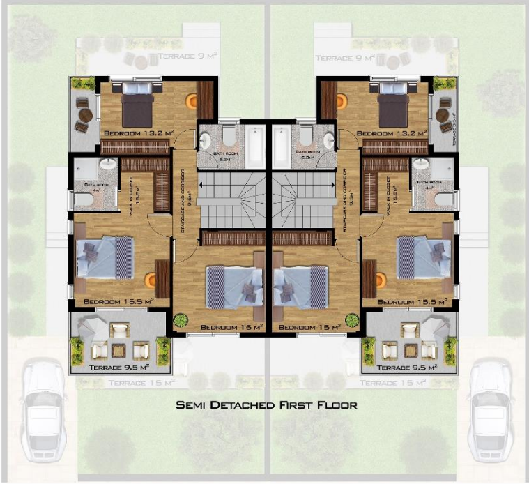
SEMI DETACHED FIRST FLOOR