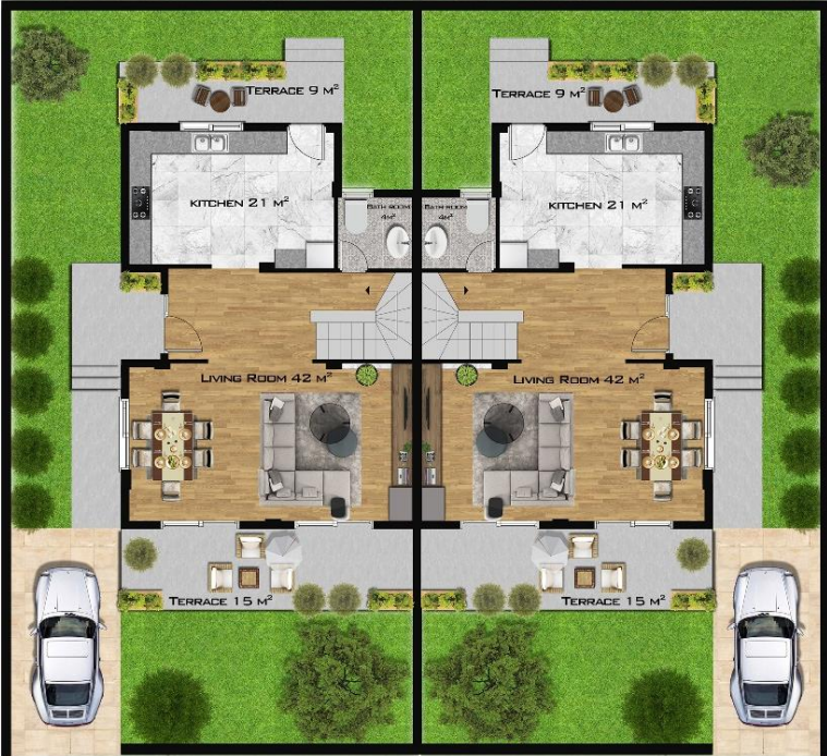
SEMI DETACHED GROUND FLOOR