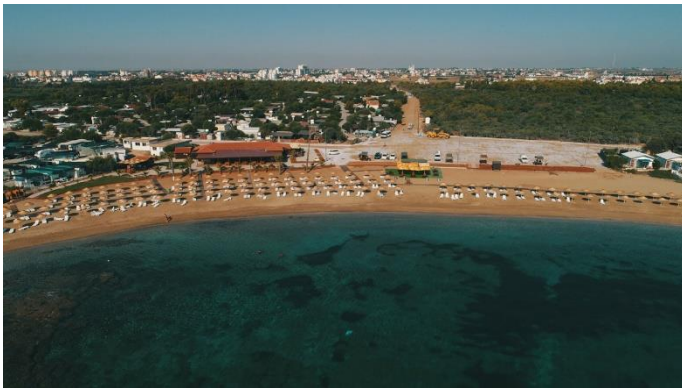
Yeniboğaziçi Public Beach