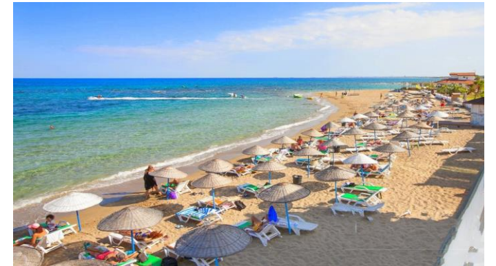
Koca Reis Beach